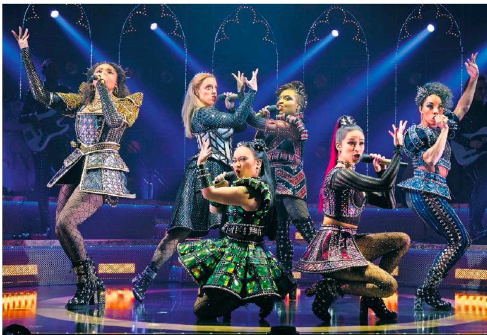
The musical "Six" was just hours from opening when Broadway shut down in 2020.