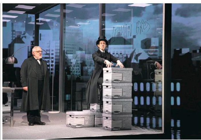
Simon Russell Beale, left, with Adam Godley in "The Lehman Trilogy."