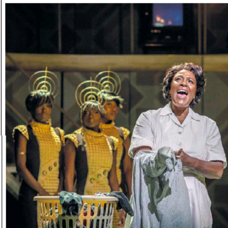
Sharon D. Clarke and ensemble in "Caroline, or Change."

CAROLINE, OR CHANCE Tony Kushner and Jeanine Tesori's musical about the relationship between a Black maid and a young Jewish boy in 1960s Louisiana was slated to land on Broadway before the pandemic hit. Thankfully, the Roundabout Theater is forging ahead with this revival, and Sharon D. Clarke will reprise the role that won her an Olivier Award in 2019. Michael Longhurst directs. Previews begin Oct. 8; Oct. 27-Jan. 9; Studio 54