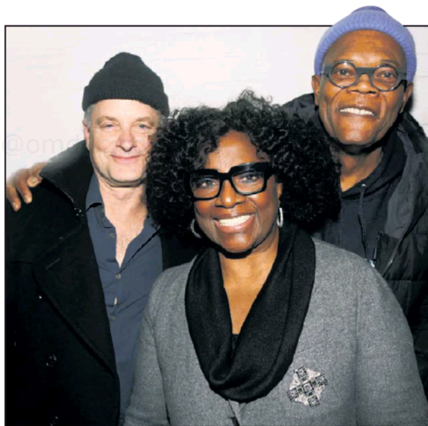
Shea Whigham (left) stops in to see pals LaTanya and Samuel L. Jackson in Broadway's "The Piano Lesson."

at home? "No. He's not that type guy. We're not in bed and me rehearsing him. We watch movies. Maybe in my foolishness of being a black woman in America, I wasn't even scared to be directing something this major — and I never thought of anyone but Sam for this.